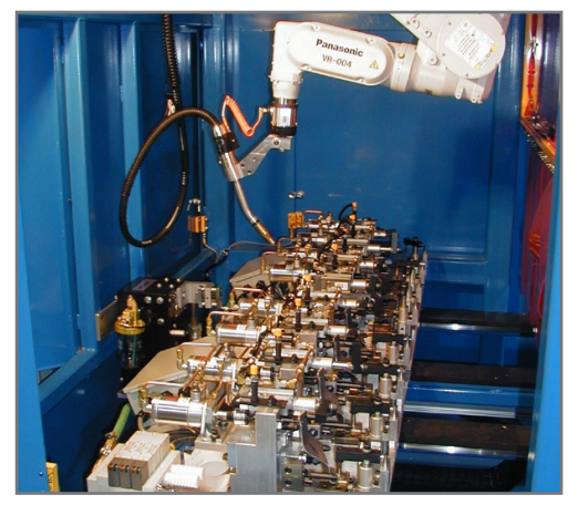
Mini-Shuttle™ interior with tooling